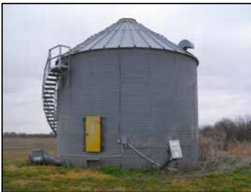
This 10,000 bushel grain bin is conveniently located for both field and hauling access. It is equipped with both an air drying fan and unloading auger.